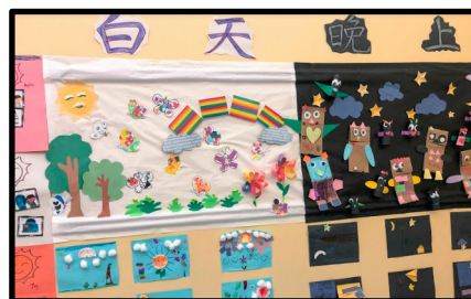
KM's project illustrating the differences between day and night.