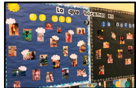
KS2 students brought in pictures of what they do during the day and during the night!