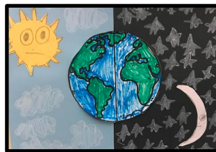
Kindergarten's illustrations showing our earth at day and night